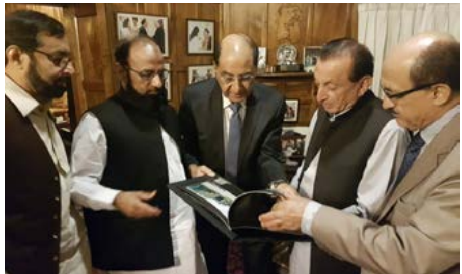
President and other members of CPSP delegation shared the short pictorial history of 50 years of CPSP with Governor of Gilgit-Baltistan