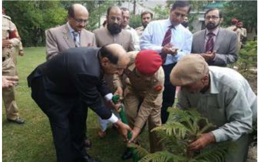
A view of planting at Gilgit-Baltistan by the President with his delegation